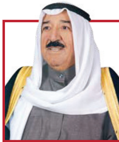
His Highness Sheikh Sabah Al Ahmad Al Sabah Amir of State of Kuwait