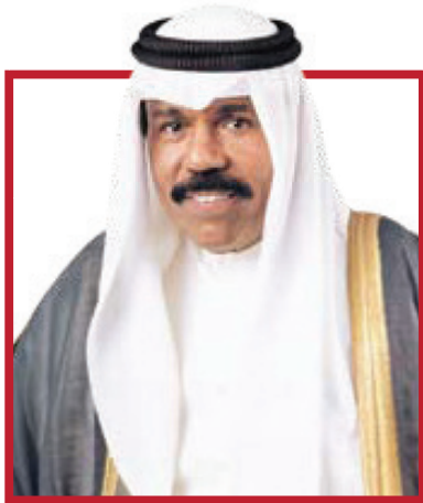
His Highness Sheikh Nawaf Al Ahmad Al Sabah Crown Prince of State of Kuwait